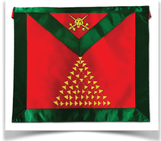
The apron of the 15th Degree: Knight of the East