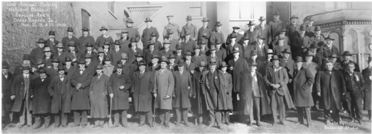
1919 Photo of MSA's Origin

Now, it is framed and hanging at the MSA office. Do you know who is in the photo?