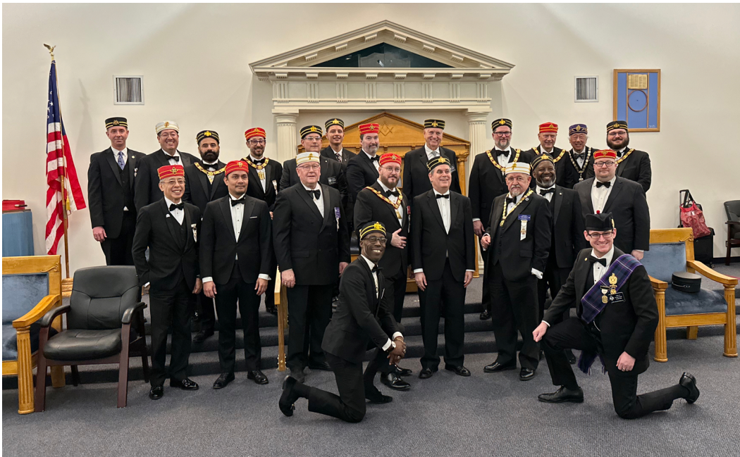
2024 Officers and Installation Team – Orange County Scottish Rite, Orient of California, Southern Jurisdiction